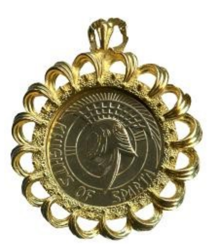
1986 Gold Back