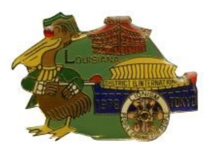
1978 V Gem Stone Eyes Was THE Pin to Get at the LCI Convention in Tokyo

NOTE: These Mardi Gras style coins were given away by the Lions of Louisiana during the 1977 Lions Clubs International Convention in New Orleans. The backs of the gold and purple coins are identical to the silver coin shown above.