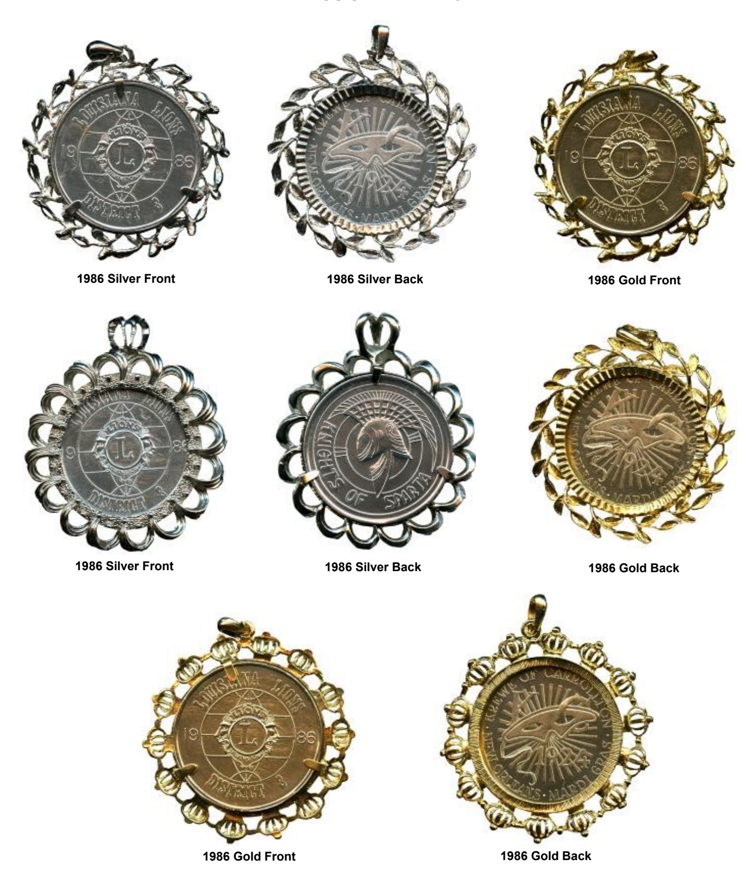
1986 Mardi Gras Medallions Given at the LCI Convention by the Lions of Louisiana