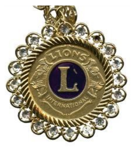
1986 Gold Front