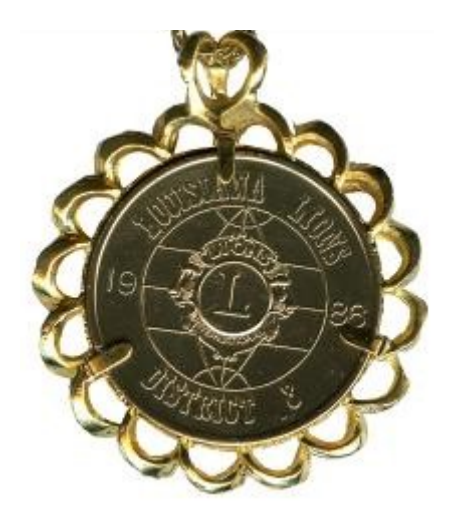
1986 Gold Front