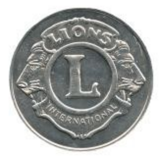
1977 Silver Coin Front