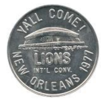
1977 Silver Coin Back