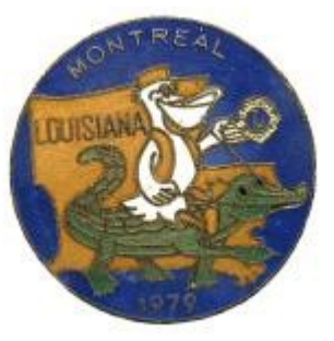
1979 V-1 Light Green Alligator