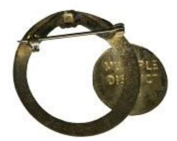
1967 Broach Shows "MD 33" on Reverse