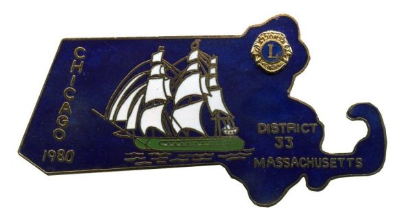
1980 V Dark Blue