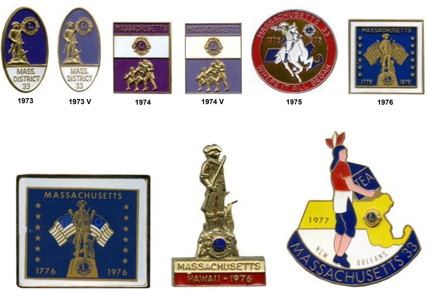
1976 Belt Buckle