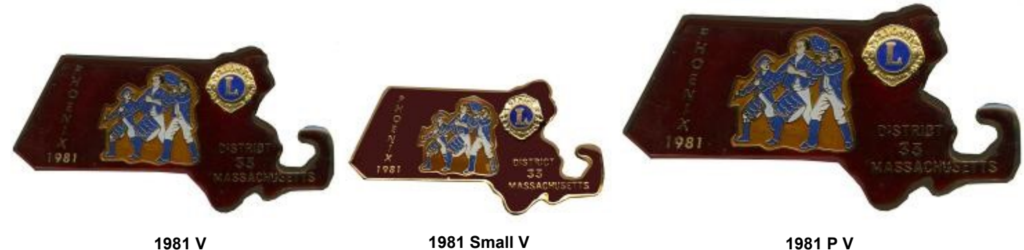
1981 P V