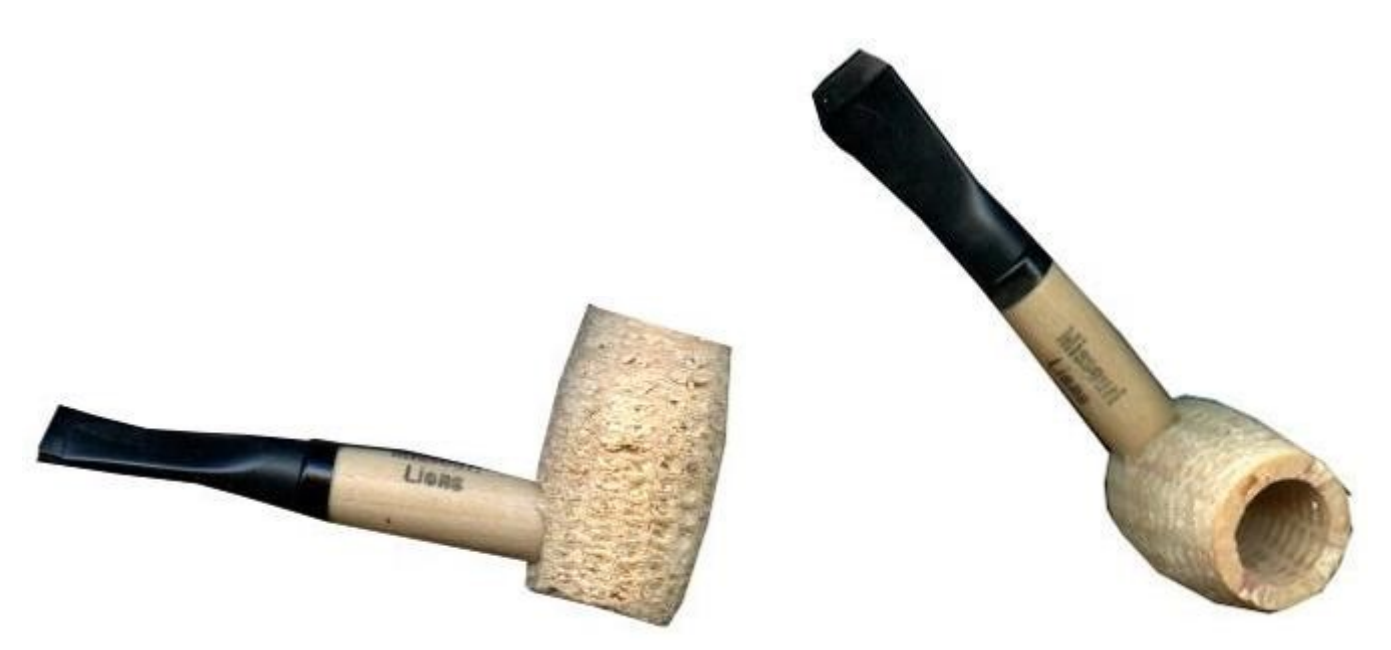
A Missouri Lions Corn Cob Pipe