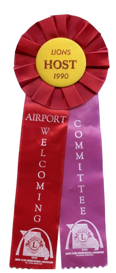
1990 Highly Collectible Host Committee Welcoming Ribbon for the 1990 LCI Convention in St Louis, Missouri (Reduced in size for display on this page)