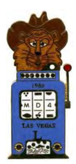
1985 Origin unknown