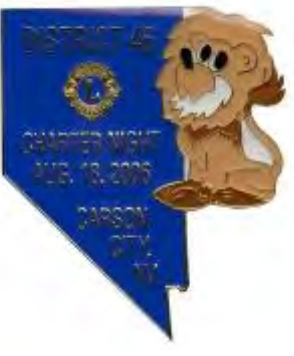
2006 Special This pin was given to attendees at the Charter Night for the newly formed District 46 (Nevada), which heretofore had been part of MD-4.