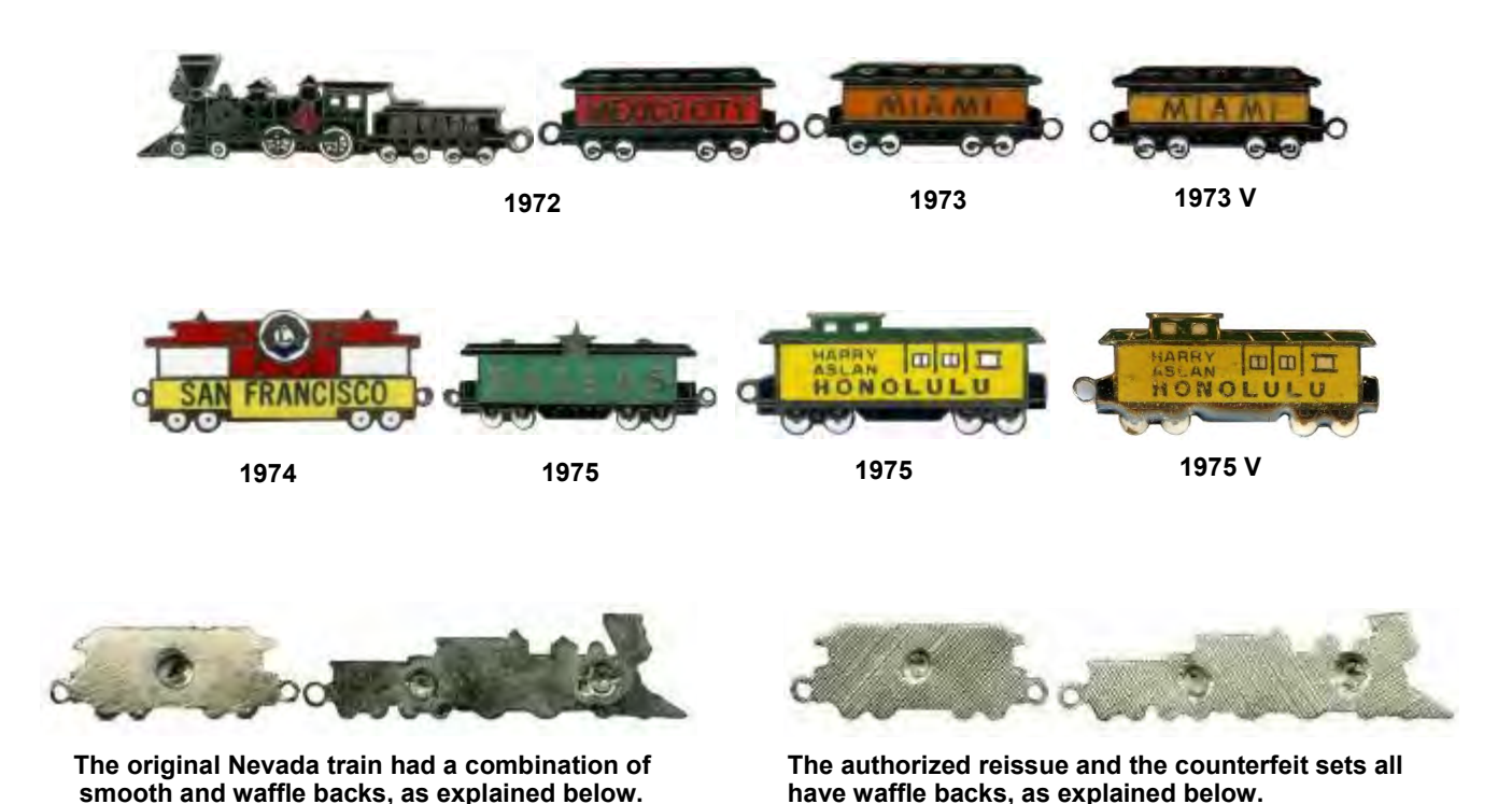
NOTE: Arguably, the Nevada Train Set is the most "famous" of all the train sets that have been made over the years. When the original set was issued, the first three cars of the train had a smooth back and the latter three a waffle back. All of these pins have a small head nail with the nail being only slightly larger than the shaft. An authorized reissue of the set produced an all-waffle backs with small head nails that were only slightly larger than the shaft. Later, a counterfeit set was made by a Lion who is now deceased and that set produced all waffle backs with the nail heads three times as wide as the shaft.

In 1969 and 1971 Nevada was a part of MD 4 and the then District Governor in Nevada in each of those years had these pins made. They are actually personal pins bearing the District Governors name but they were the only pins from Nevada at the time and were traded as their state pin. They are considered by most pin traders as the first and Third Nevada pins. They were shown as such in the State Pin Pictorial Guide, which was the first color catalog of state pins. They continues to bring high prices at sales and auctions. Although the 1970 pin does not show the District Governors name, it too was made and traded as their state pin. In 1972, although still a sub-district of MD 4, they started issuing a separate pin for the state of Nevada and most of these pins have 4N on them. In 2007 they became a separate District and were no longer a part of MD 4.