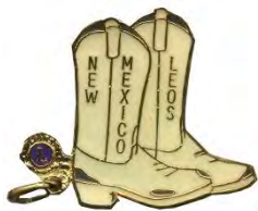
Leo Date Unknown

Beaded shoes on ribbons were early items given away by the Lions of New Mexico at International Conventions. The example on the right has "New Mexico" stamped on the head. The example on the left and center have "New Mexico. District 40" There are several different versions of these probably made by many different Lions for the conventions. These are highly collectable.