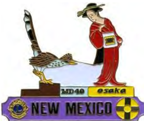
2002 P (Red Kimono)