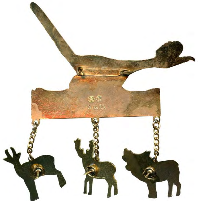
1981 P Reverse (Gold)