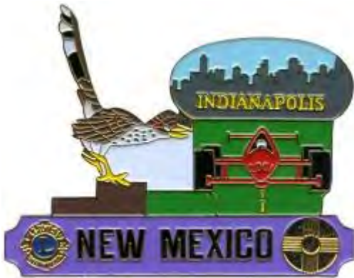
2001 P (Without M-40)