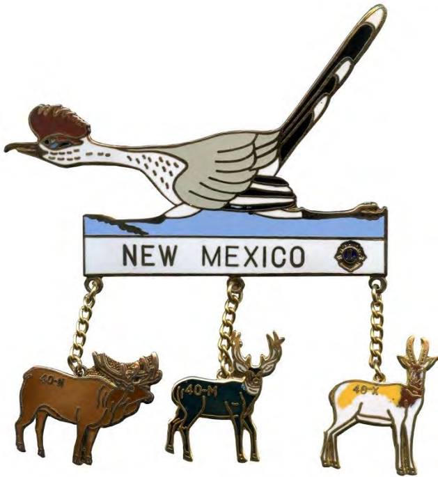
1981 P V (Silver)