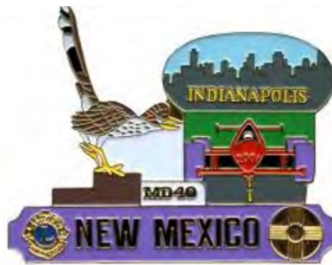
2001 P (With M-40)