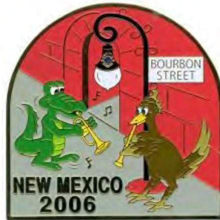
2006 New Orleans