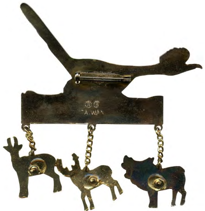
1981 P V Reverse (Silver)