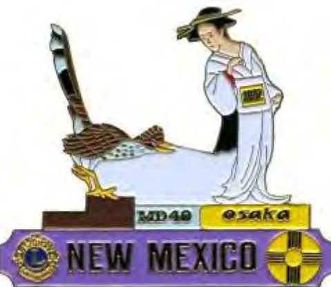
2002 P (White Kimono)