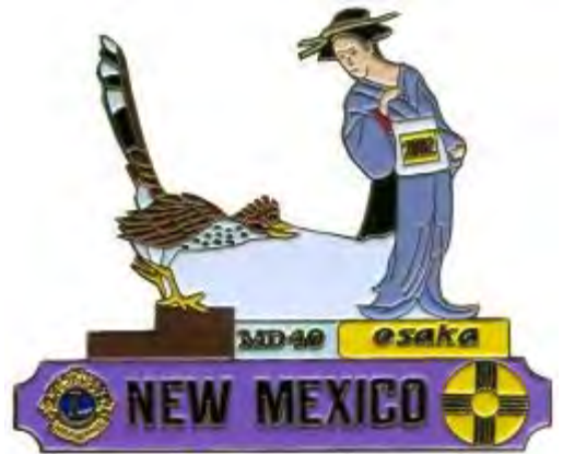
2002 P (White Kimono)

NOTE: All of the pins on this page were traded at the international conventions as the actual prestige pins from NM. In reality they were not approved by the MD 40 Council of Governors but were instead issued by a PDG who had moved from another state and was the same person responsible for the 1999 non-approved issues. These pins are in most collections as the prestige pins for the years shown and are recognized by most pin traders as the actual issues for those years since they were and still are traded as such. These facts are being revealed in writing for the first time.