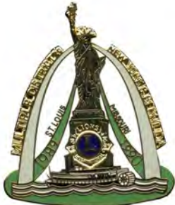
1990 V Gold Border