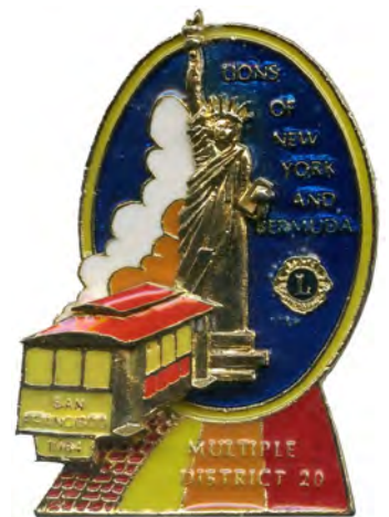
1984 P V Dark Blue Background Dark Yellow Strip