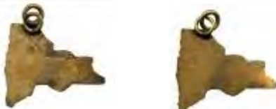
1964 Charm (Reverse)

The above two examples of the backs of the 1964 Charm showing that the loop is on the back of the pin rather than the top. There is no evidence of a solder so it is assumed that this was created by the factory.