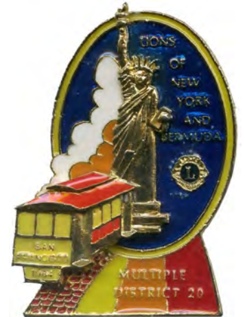
1984 P V Dark Blue Background Dark Yellow Strip