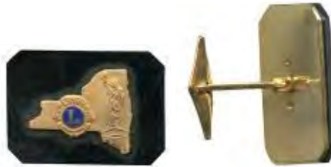
1984 Cuff Links