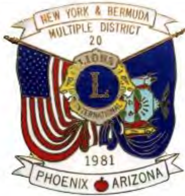
1981-1 V Bright Red Stripes & Apple