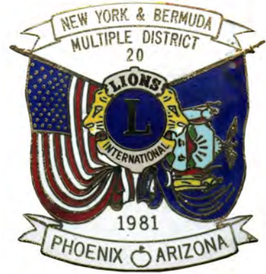
1981-2 White Apple