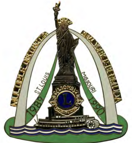
1990 P V Gold Border