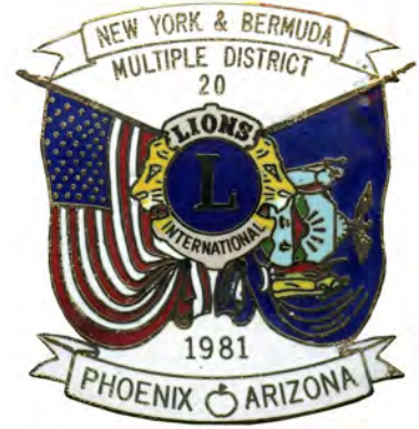
1981 V-2 White Apple