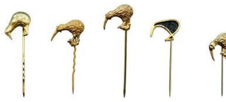
Early Stickpins The five stickpins shown above have been used by the Lions at several LCI conventions. However, there is no evidence that they were originally produced by Lions or Lions organizations for this purpose.