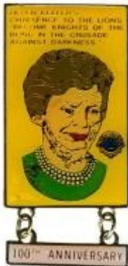
A Salute to Helen Keller on the 100TH ANNIVERSARY of Her Famous Charge to the LIONS to be the Knights of the

75th ANNIVERSARY OF LIONISM IN PENNSYLVANIA