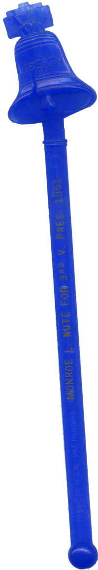
1951 Plastic Drink Liberty Bell Stirrer