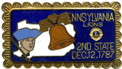
"Pennsylvania Lions 2nd State Dec 12 1787"

NOTE: There were only two Multiple District 14 pins officially issued in 1981, including a stickpin and shown on page PA-2. The two pins are poly coated and contain the wording "300th ANNIVERSARY WM PENN LAMD GRANT PENNSYLVANIA." The five similar pins shown on this page were produced using a semi-cloisonné finish. The wording on these pins are "THE LIONS OF PENNSYLVANIA SALUTE THE STATES 300th ANNIVERSARY." Unless we are advised otherwise, we must assume that these pins are samples that were never officially issued. Although we know of only three sets of these pins, there very well could be more.