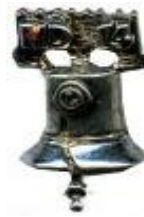
MD-14 Liberty Bell Silver