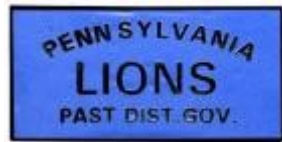
Issued by the State in Honor of the PDGs