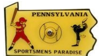
THE SPORTSMENS PARADISE SET