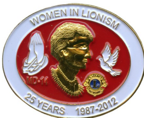
2012 25 Years of Service by Women in Lions