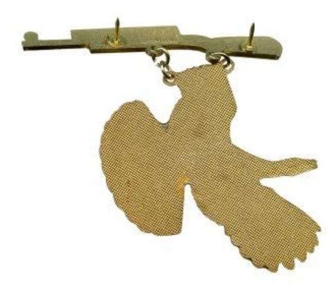
1984 Reverse No Trademark