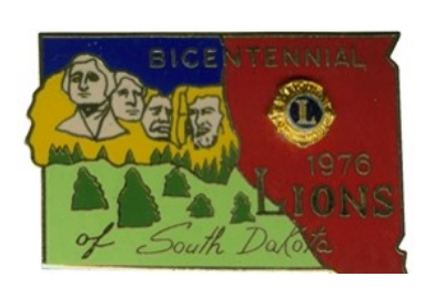
1976-2 Yellow Mountains