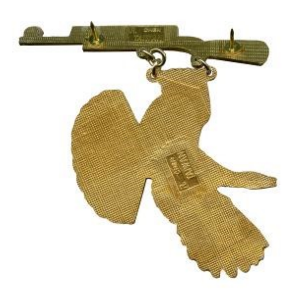
1984 Reverse Trademark Chen Taiwan