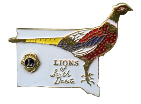
1974 V Blunt Tail Waffle Back)

NOTE: The emblems on the 1974 pins are glued on. We have seen several different sizes, some smaller and some larger than the ones shown here.