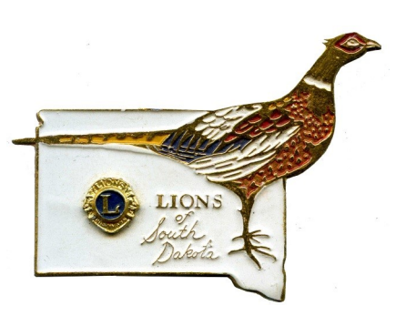
1974 Sharp Tail Plain Back