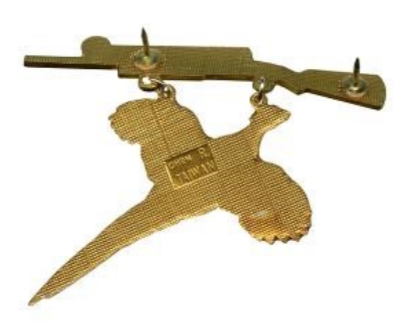
1981 Reverse (Trademark)