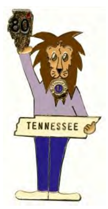
1980 Origin Unknown Probably a Sample