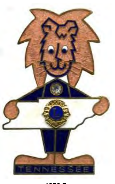
1976 P White Stone