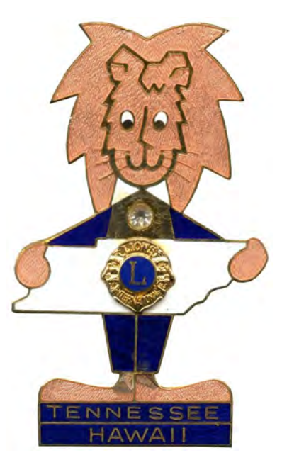
1976 Origin Unknown White Stone Hawaii on Base

NOTE: Several Tennessee Lions removed the blue stone from the 1972 pin and inserted a red stone in its place. There was NO prestige pin in 1973.