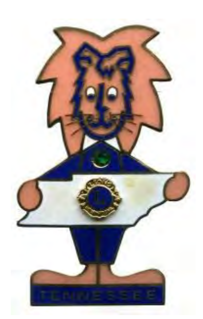
1975 P Green Stone