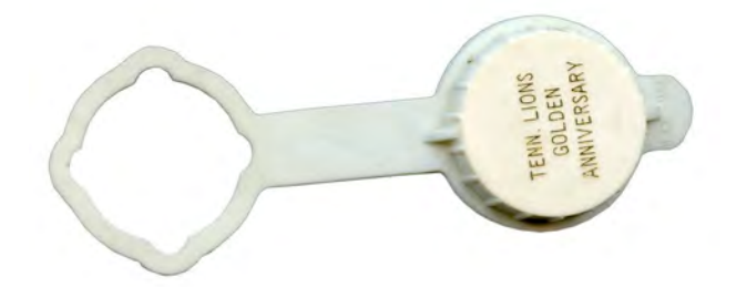
Give away to celebrate the Lions Golden Anniversary