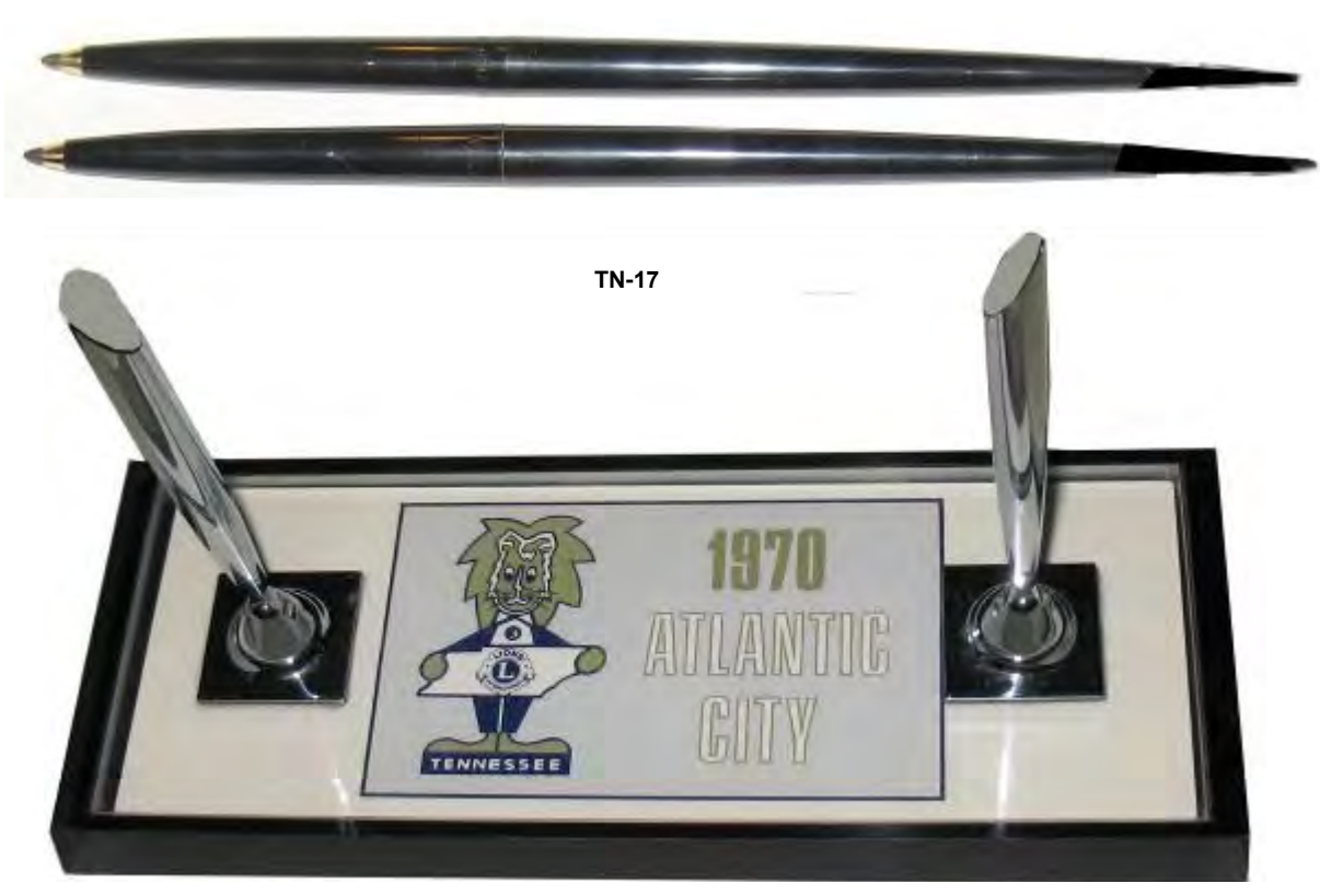
1970 LCI Convention Atlantic City, NJ