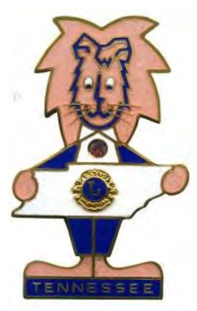
1969 This pin was used for 1969-71. Both the 1969 and the 1970 Regular pin had a RED Stone