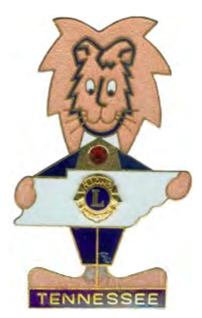
1973 Red Stone

NOTE: Several Tennessee Lions removed the blue stone from the 1972 pin and inserted a red stone in its place. There was NO prestige pin in 1973.