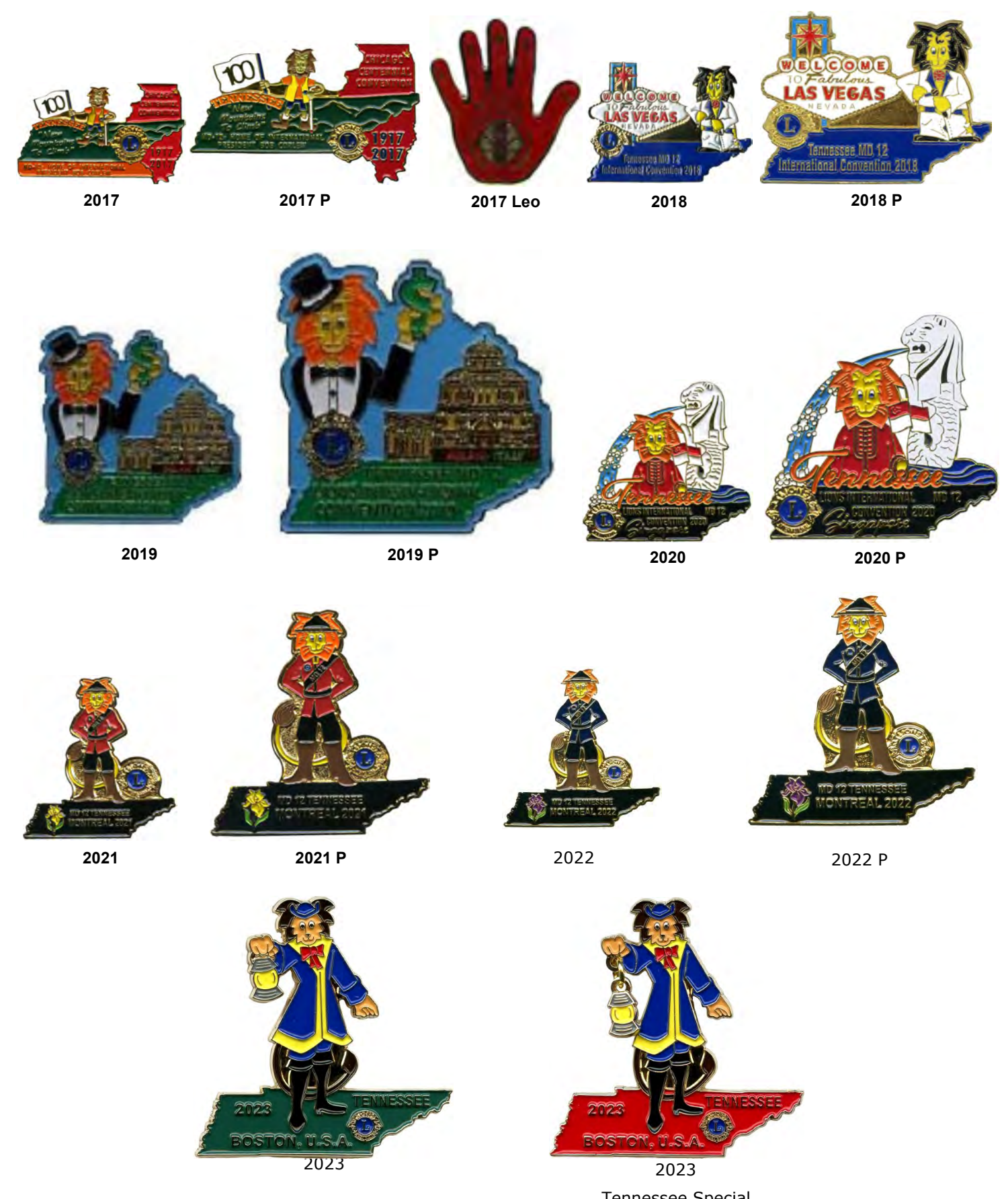
Tennessee Special Note: This pin can be obtained from PDG Dave Crawford of Tennessee