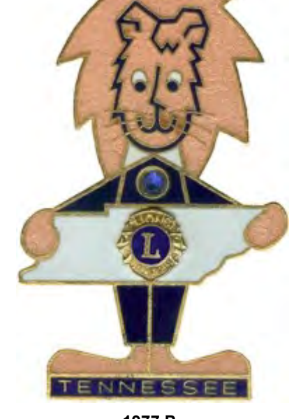
1977 P Blue Stone