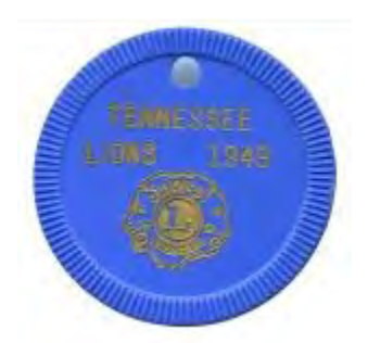
1949 Poker Chip