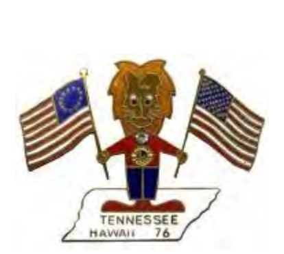
1976 White Stone