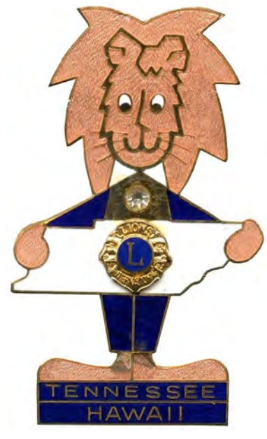
1976 P V White Stone Hawaii on Base