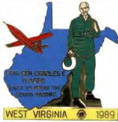
1989 V Green Flight Suit