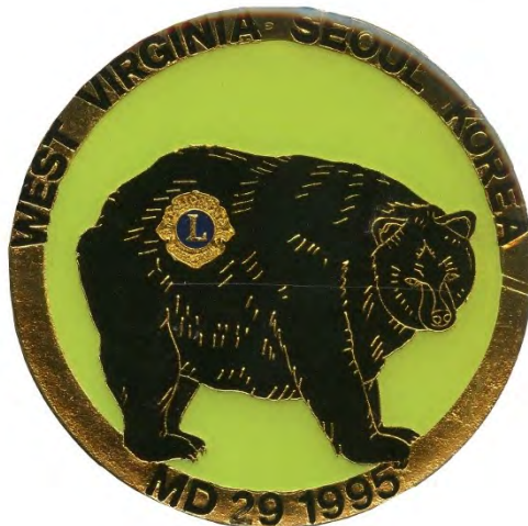
1995 P V