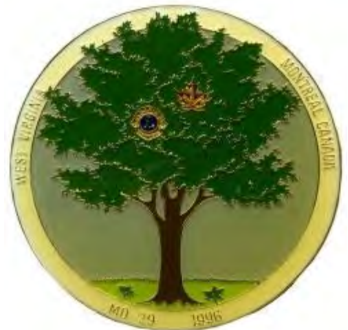
1996 P V Emblem in Tree