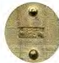
1999 Lioness HO-Ho Trademark