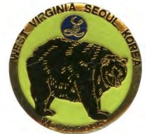
1995 Lioness V