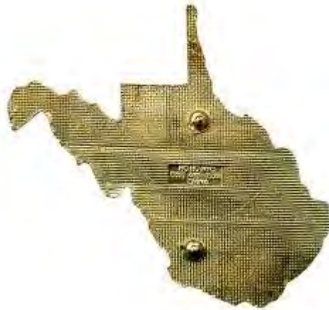
1999 P HO-Ho Trademark