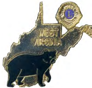
1980 V-2 Black